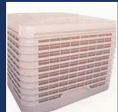
Evaporative Cooling Unit