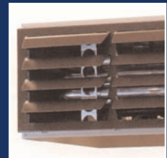
High Efficiency Unit Heater