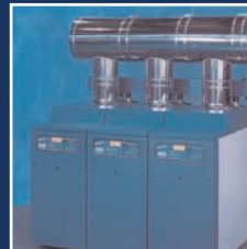
Floor Standing Heating Boilers