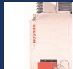
Warm Air Cabinet Heater